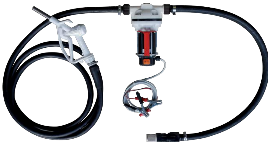
SUZZARABLUE PORTABLE KIT